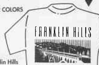
Franklin Hills End of Summer Festival T-shirts