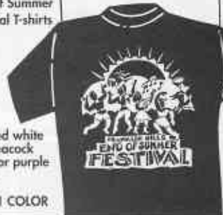
Printed white on peacock blue or purple shirt