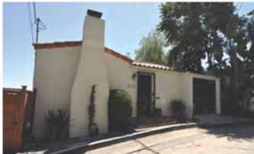
www.2212RondaVistaDrive.com $729,000 (just sold)