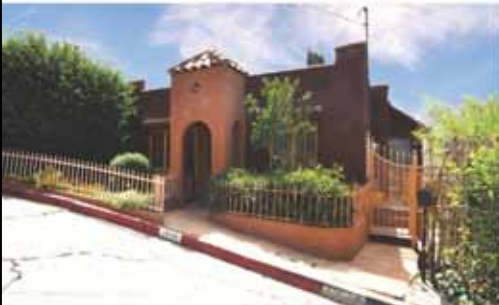
www.1936MayviewDrive.com $549,000 (in escrow)