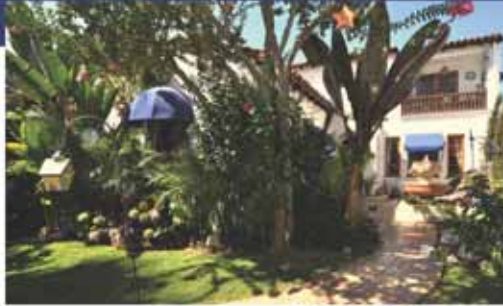
www.4953AmbroseAvenue.com $1,250,000 (just sold)